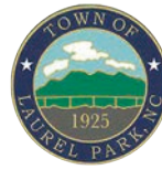
Town of Laurel Park